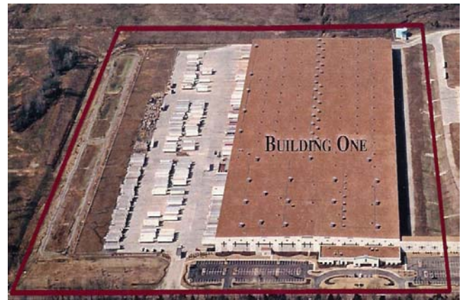
Williams-Sonoma Distribution Center and Offices Olive Branch, Mississippi (Metropolitan Memphis, TN)