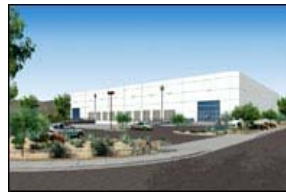
641 S. 53rd Avenue Phoenix, Arizona

Plans call for 24' - 27' clear height, ESFR sprinkler, rail service and will accommodate