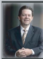
Dr. Art Laffer